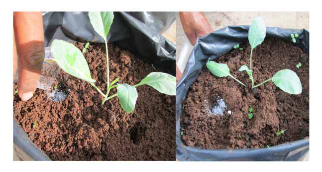
Figure 3. The recommended fertilizers using urea, SP-36, and KCI

The main investigation in this study included soil quality with soil pHmeasurements and the weight of cabbage flower plants. the results of the cauliflower plant weight can be seen in Chart 1, as well as the photos of the plants according to the treatment can be seen in Figure 4.