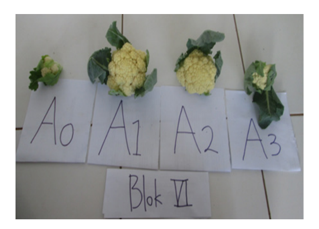
Figure. 4. Cauliflower crop results