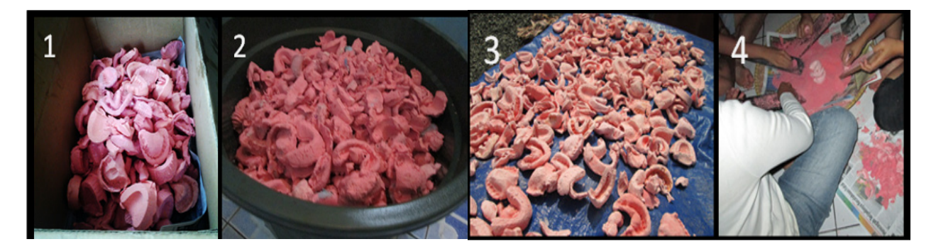
Figure 1. Dental Alginate Wastes Preparation

The tool used in this research were hoe, polybag, paper label, plastic bucket, water hose, hand sprayer, analytical scale and pH meter. Experiments were using 7 samples of 0% dental alginate waste (DAW) samples ( A_0 ) as control and 3 treatment groups ( A_1 , A_2 , and A_3 ) with 7 replications each. The A_1 treatment group used